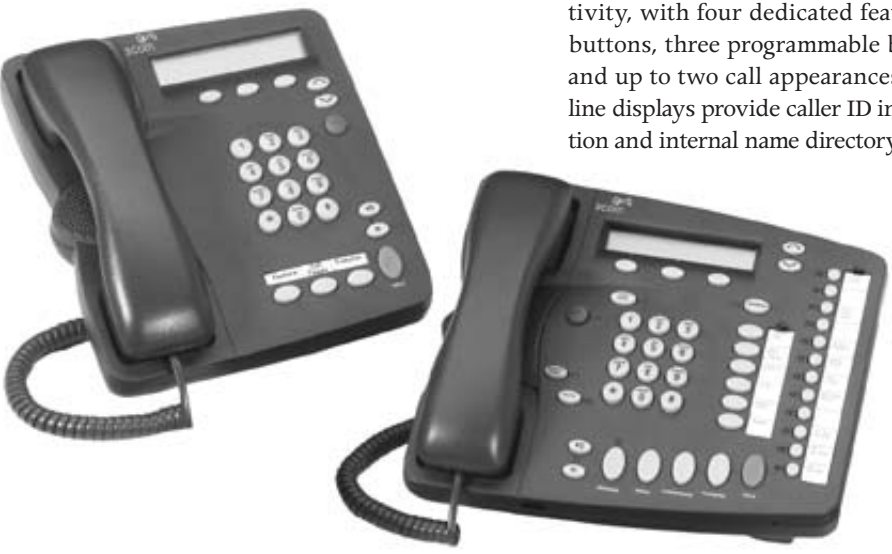
Right to Left: 3Com NBX Business Phone offering easy access to a full suite of features and services, including connectivity to Palm Computing OS-enabled organizers; 3Com NBX Basic Phone, ideal for locations needing intelligent, multiline IP/Ethernet connectivity at an exceptionally affordable price.

These phones offer affordable, simple, and powerful 10/100 Ethernet connectivity, with four dedicated feature buttons, three programmable buttons, and up to two call appearances. Twoline displays provide caller ID information and internal name directory access.