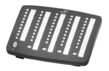
If required in larger enterprises, multple NBX Attendant Consoles can be used on a single desktop.

What's more important than the first impression clients get when they call your organization? 3Com worktop options include attendant consoles that help receptionists manage calls with efficiency and professionalism.