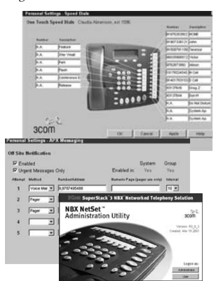
The user-friendly browser-based interfaces of NBX NetSet make programming and managing NBX phones easy and convenient.

An incredibly intuitive administrative interface—3Com NBX NetSet<sup>™</sup>—lets administrators fully customize 3Com NBX phones to meet business needs and customer expectations. This browser-based utility features pull-down menu choices tailored to the capabilities of each type of phone. For larger organizations, it offers time saving tools that simplify creation of departmental profiles for managing a large number of users.